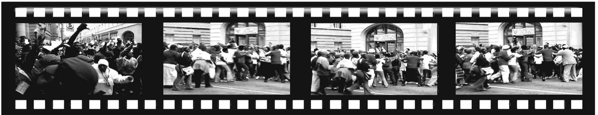
TAC violence in front of the Cape High Court on 13 May 2005

The breakthrough for the natural control of the AIDS epidemic inevitably means the end of the multi-billion dollar business with toxic, ineffective and patented drugs, which are being pushed into South Africa by pharmaceutical multinationals. Over the years the pharmaceutical drug cartel has used its front organizations like the DA and TAC to force the South African government to pay for the distribution of these dangerous drugs to AIDS patients in South Africa. This has only been possible for as long as the scientific knowledge about the benefits of vitamins and micronutrients in the fight against AIDS has been unknown. Now that this knowledge about the natural control of AIDS has been made public, the TAC and other front organizations of the drug cartel are desperately fighting this knowledge to protect the investment business of their funders.